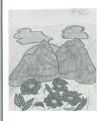
— Amy Poblete