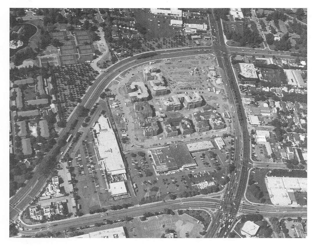
The 16-acre piece of Olson cherry orchard in Sunnyvale under construction, November 2000.

industry employees include clerical workers, teachers, police and firemen, building maintenance workers, fast food employees and farm workers. And the environmentalists claim that the Cisco project will degrade the environment, especially the fragile Coyote Creek habitat adjacent to the site.