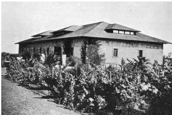
Baldwin Winery, late 1800s

He planted vineyards and built the Beaulieu winery and wine cellar (Beaulieu meaning “beautiful place”) and made award-winning wine. The winery building, built in 1887, with its underground cellars, is the oldest of the Baldwin estate's late 19th century structures.