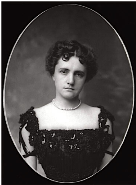
A portrait of Harriet Pullman from the late 1800s.

The Baldwins had the first private swimming pool in Cupertino, located in the Sunken Garden. The site of that swimming pool is now the fountain area of the Sunken Garden. Charles and Virginia Baldwin grew grapes and produced award winning wines on the estate until damaged by root louse, phylloxera and successive years of drought that devastated local vineyards in the late 1890s.